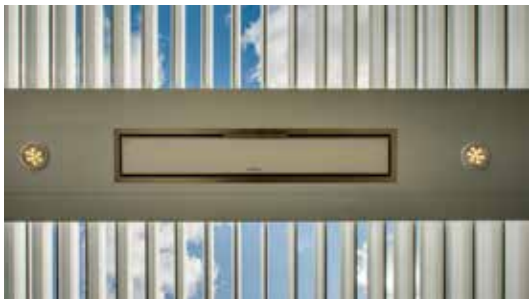
Beam Chases (Can Lights, etc.)