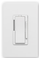
WFD30 (PJS26W wallplate sold separately)