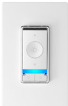
WFAVD30 (PJS26W wallplate sold separately)