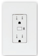
WFTRCR15 (PJS26W wallplate sold separately)