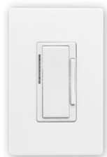
WACD (PJS26W wallplate sold separately)