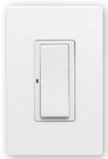
WFSW15 (PJS26W wallplate sold separately)