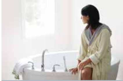
Water Heating Solutions